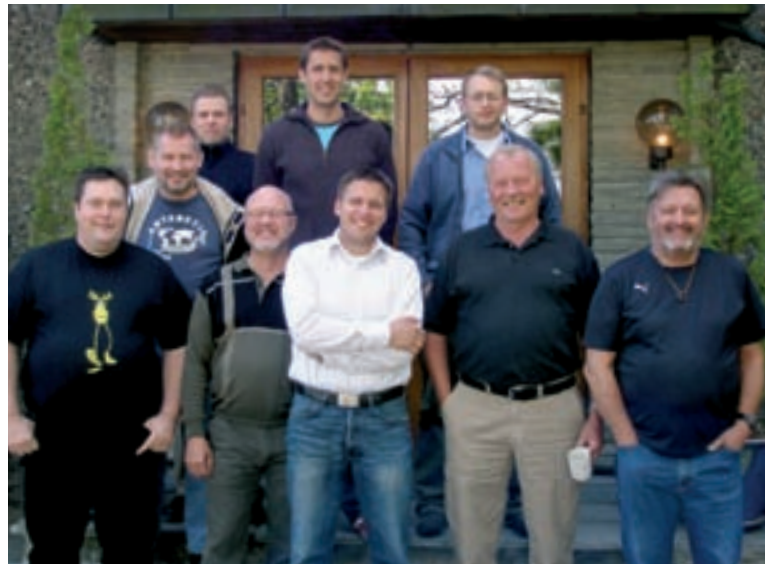
Users from Crew Chart and Donsötank at training course in Horten

The implementation project at Norwegian ship owner Torvald Klaveness is now completed with an interface to SAP and with Consultas PMS installed onboard the fleet. This project, which has been very well steered by Klaveness, has given us valuable experience in building interfaces with external systems.